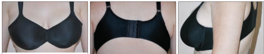
After: A Visit To Leisure & Lace Assures A Proper Fit Every Time. See For Yourself!