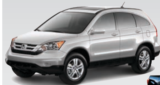
2010 Honda CR-V